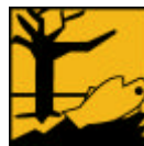
Dangerous for the environment